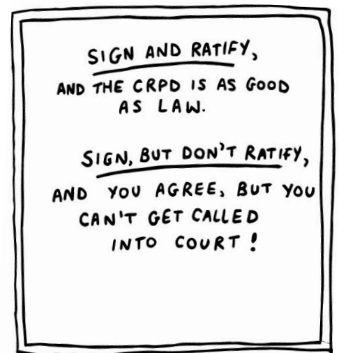
Illustration by Pip Malone